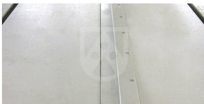
Polystone® P flex en plantas de galvanoplastia o decapado de acero