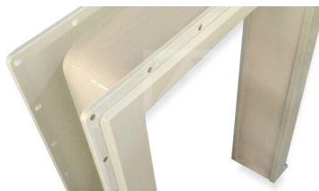
Polystone® P flex en plantas de galvanoplastia o decapado de acero